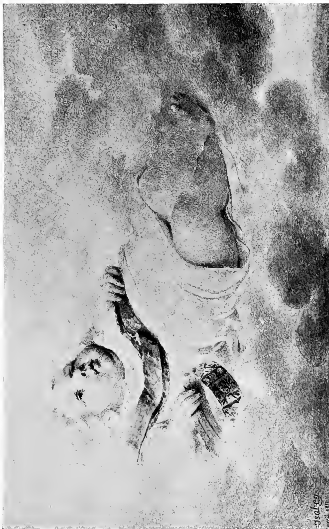
THE KING OF ROME From a water-colour drawing by Isaly, 1811. In the Private Library of the Emperor Francis Joseph I